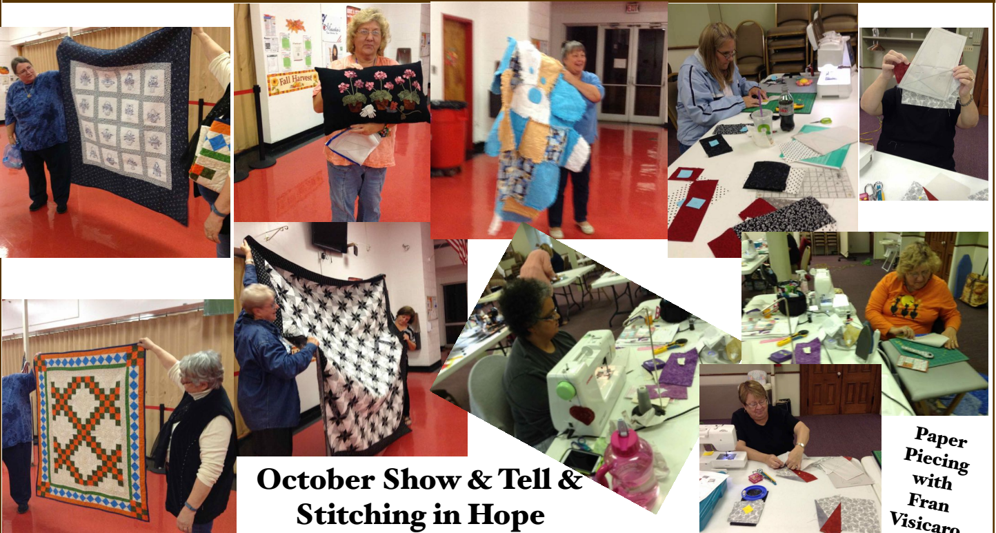
October Show & Tell & Stitching in Hope