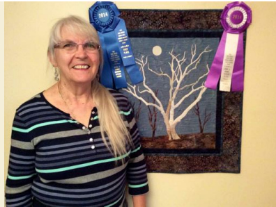
“Where Do You Sew?”