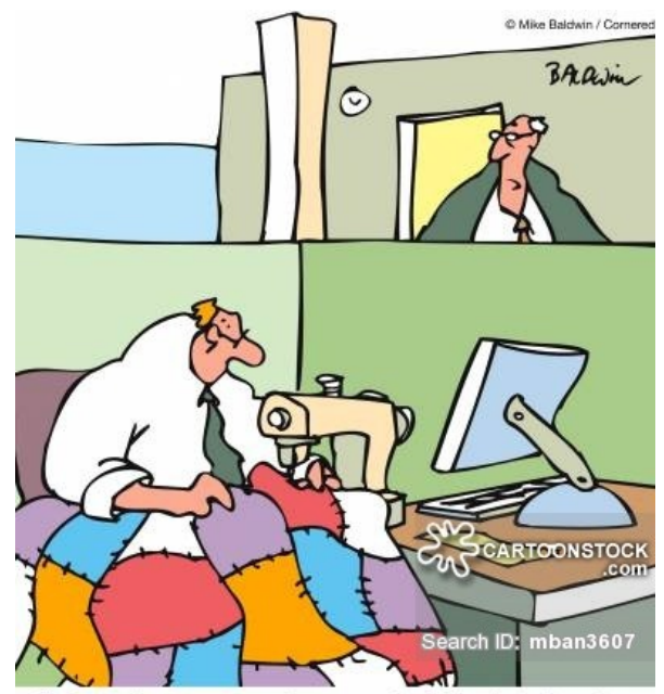
"You threatened to quit if I didn't give you a raise, not quilt."