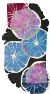
Grapefruit Slices Featured Contemporary Quilter Amy Selmanoff