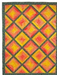
Garden Strips Featured Traditional Quilter Carol Gevecker Graves

Hours: 10 a.m. to 5 p.m. Admission $8 Advance tickets $7 Groups of 5 or more advance tickets $6 each