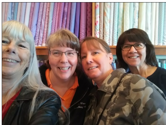
A few of the ladies took a Saturday to do some shop-hopping...